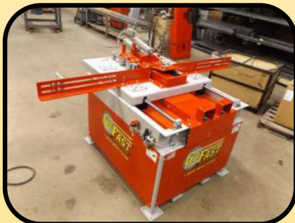
TABLE MOVES W/ DUAL AIR RAMS AND LINEAR BEARINGS